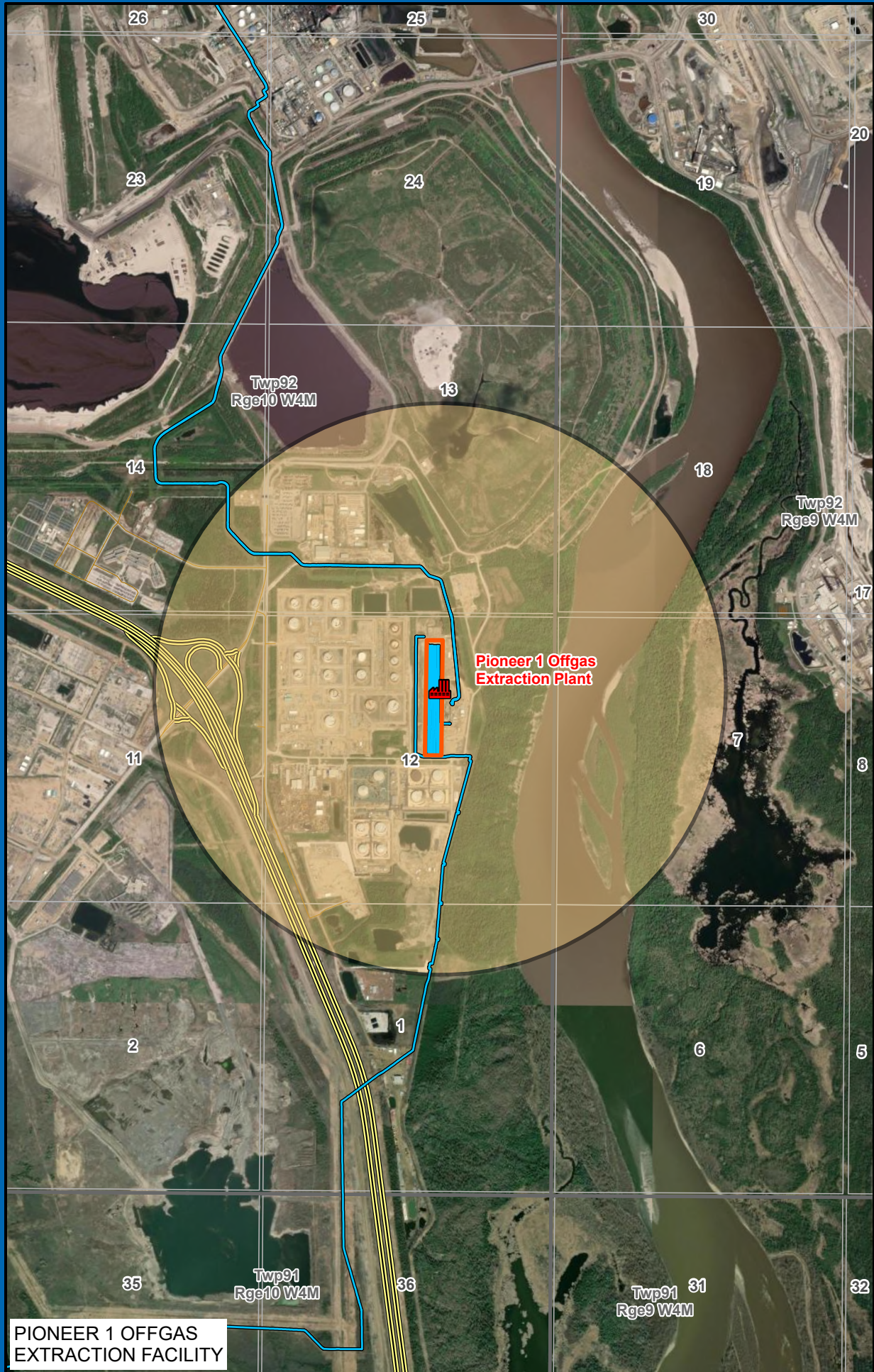
PIONEER 1 OFFGAS EXTRACTION FACILITY