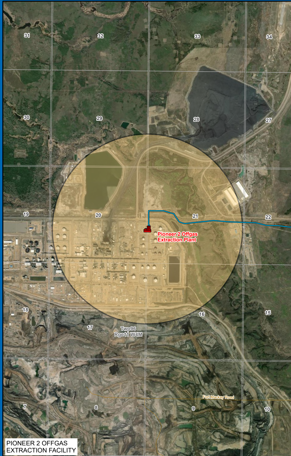
PIONEER 2 OFFGAS EXTRACTION FACILITY